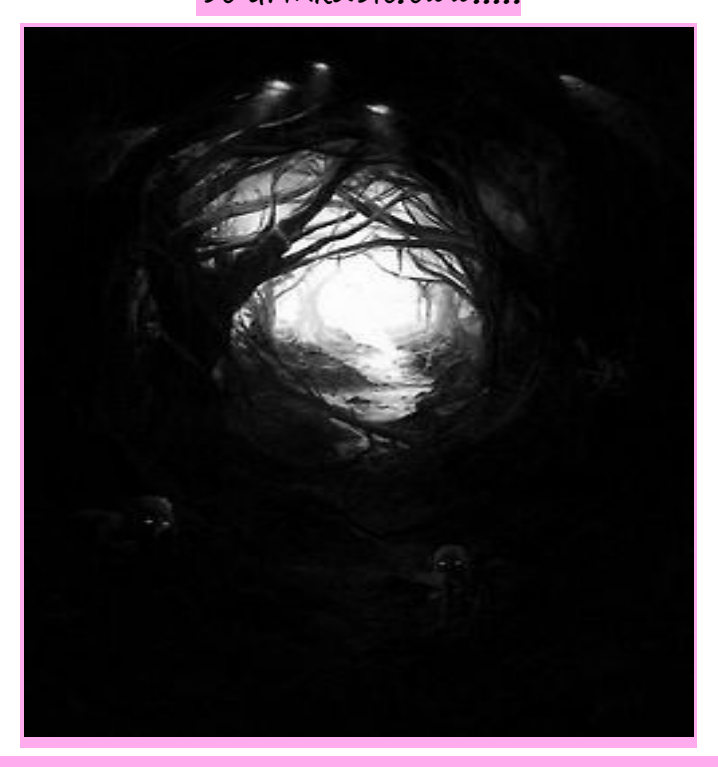
My coloured pencils snapped and I have no sharpener :( So i had to draw the cave in black and that reminded me of creepiness so...now it's creepy!

Dear diary,i think it's june 18th? But it feels like we've been here FOREVER!!I got zero sleep tonight!!The worst thing is, we can't even tell when it's night or day!i've seen 3 bats at the darkest end of the cave!I THINK I'M GOING CRAZY!!I've started talking to this random spider like it's a DOG:(our coach and teacher have set out these fire torches along the sand in the cave!and we have to boil our water so that it can be drinkable!eww!!!!!